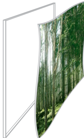
example: 180 cm x 150 cm x 4,2 cm